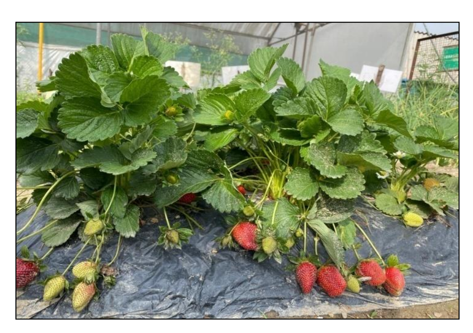
Plate 1. Fruiting stage of strawberry at experimental site

enhanced N availability in soil from biological N-fixing bacteria and increased P facilitated by phosphate solubilizing bacteria (PSB) (Rana and Chandel, 2003). Synergism among Azospirillum along with PSB and Azotobacter with PSB might have resulted better in strawberry yield as against single inoculation (Singh et al., 2010). The combined application of organic manure and biofertilizers has shown better results in crop yield (Negi et al., 2021).